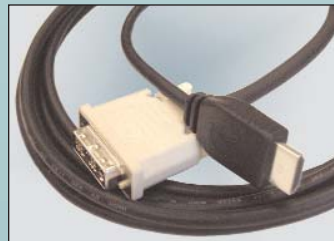
CA-U710000 HDMI-DVI cable assembly

CA's high quality cable assemblies are available as HDMI-to-HDMI assemblies, as well as HDMI-to-DVI assemblies. The assemblies are offered in standard cable lengths or customized for specific applications.