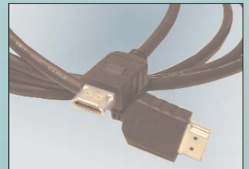
CA-U710001 HDMI-HDMI cable assembly