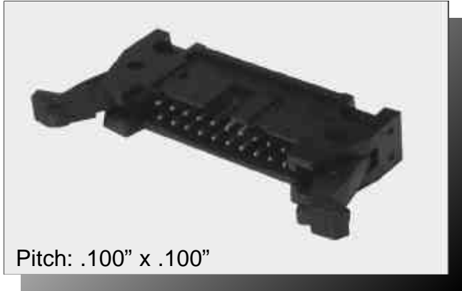
Pitch: .100" x .100"